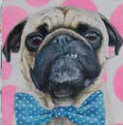
'Paws & Claws' Dog & Cat Art Exhibition 6 - 26 Jul