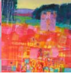
Boag & Phillips Two Person Exhibition 7 - 28 Sept