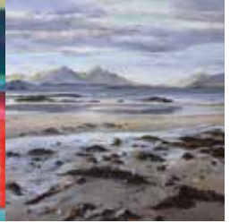
Fiona Haldane Solo Exhibition 5 - 26 Oct

30 Gray street, Broughty Ferry | eastudios.com | 01382 737011